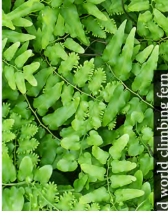
Old world climbing fern Lygodium microphyllum