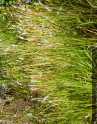
mperata cylindrica Cogongrass