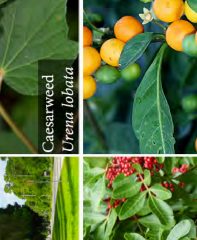
Schinus terebinthifolia Brazilian Pepper