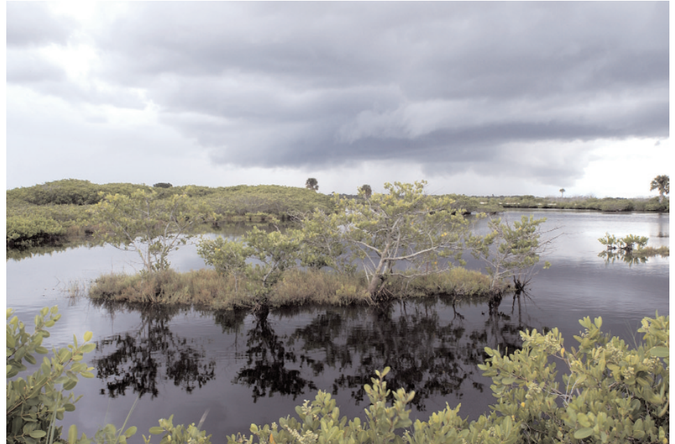
Indian River Lagoon